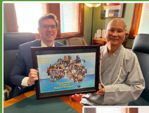
Artwork by Pure Land Learning College <<<