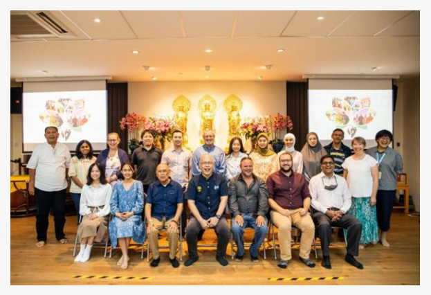
TIWG visit to IMC, Singapore