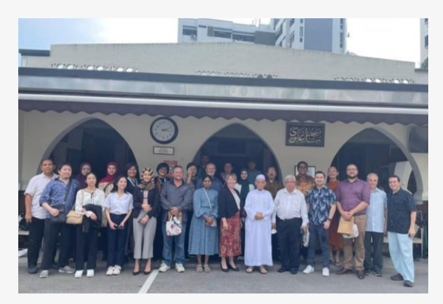
TIWG visit to Ba'alwie Mosque, Singapore

The Toowoomba Interfaith Working Group (TIWG) was formed in 2016 and is now represented by twenty-two faith denominations. Besides organising conferences and workshops in Toowoomba, TIWG members have also been active participants in various international conferences and also in visiting international faith organisations.