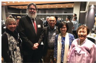
15 August 2019 – Members of TIWG at the Annual Queensland Police Multi-Faith Dinner

Member, Toowoomba Interfaith Working Group