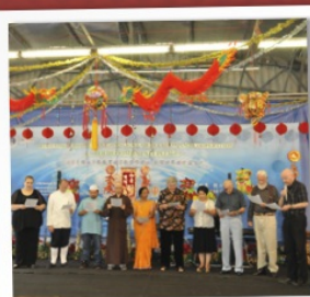
The faith leaders delivering the common prayer for Australia.