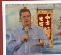
Honourable John McVeigh, M.P. Member for Toowoomba South and Minister for Agriculture, Fisheries and Forestry, giving his address.