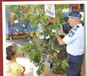
Placing good wishes for Australia on our wish tree.