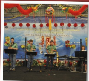
The certificate of appreciation presented to the wonderful family band Yakety Saxes who have given us so much joy and happiness through their music.