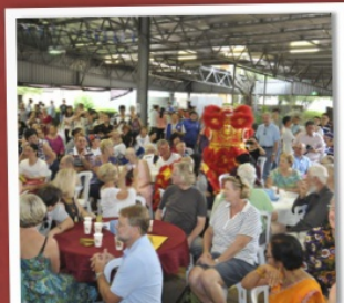
An exciting and well-known tradition of the CNY is the lion dance.