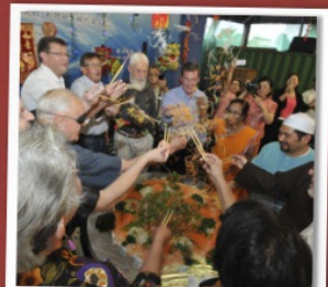
Tossing the Yusheng as high as possible, making wishes for longevity, good fortune, peace, and harmony for the new year.