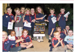
▲ The spirit of harmony from the young scouts holding the book 'Guidelines for being a good person'.